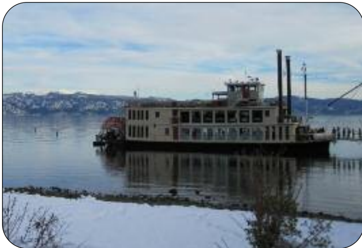
Picture Postcard Perfect — an early morning shot of the Tahoe Queen, just prior to casting off for a trek across Lake Tahoe to ski at Squaw Valley.

Barring another stellar snow storm to mess up our plans, we're going to try another "hooky day" at Blue Mountain on Thursday, March 11 - ski all day, party at night at March's meeting! Get a ticket from EPSC or purchase for $10 off at the window if you show your club membership card. Contact Larry Kirschner if you plan to attend.