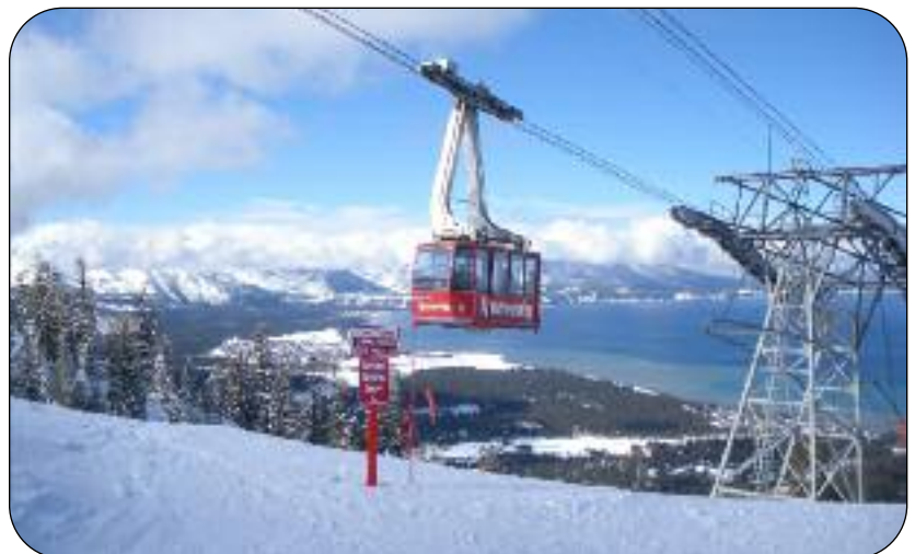
Another Picture Postcard — Always amazing scenery at Heavenly, Lake Tahoe! A sunny day, Heavenly tram, and Lake Tahoe in the background.

Join the folks at the North Penn Elks Lodge (where we hold our meetings) for a fun night of Mystery, Saturday, March 13. Tickets are $35/person and include a buffet dinner, dessert, and murder mystery performance. Doors open at 7:30pm, dinner begins at 8pm. Cash bar available. Contact the Elks at 267-446-2741 or northpennelks@comcast.net