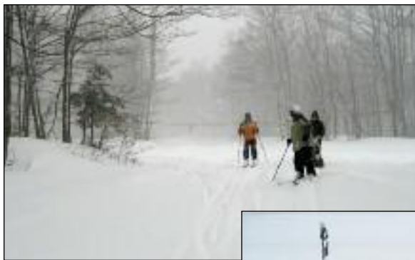
This one is called "Bailout from One Last Time"!

New England – Sounds odd that New York got so much snow since places further north like Killington received a total of 31”, and Mount Snow received a total of 37”. Unfortunately, Mount Snow got hit with wet, heavy snow and high winds, causing problems with certain lifts and requiring chairlift shutdowns. Fairly evident by the photos our club members sent from their trip that week!