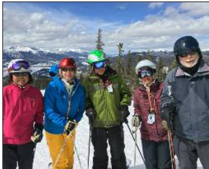
At left: Proof that “out west” was where the snow was hiding this winter – taken at Keystone Mountain in Colorado on March 13, the extended Chambers clan enjoyed a cold, beautiful day of skiing on fully snow-covered trails.