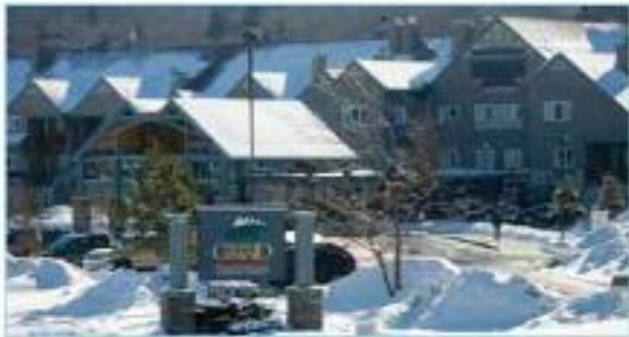
KILLINGTON GRAND RESORT HOTEL