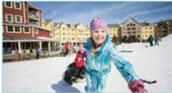
JACKSON GORE VILLAGE (OKEMO)

Killington's only full-service mountainside hotel features hotel rooms, studios, suites, and pent-houses. A wide range of amenities are available including free wireless internet, Ovations Restaurant and Lounge, convenience store / gift shop, ski and snowboard equipment check, valet parking, and game room. The health club includes weight and cardiovascular equipment, sauna, steam room, and a 75-foot outdoor heated pool with two hot tubs featuring views of Killington.